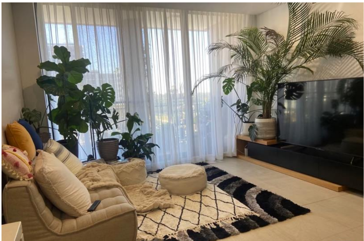
Shared lounge room – fully furnished