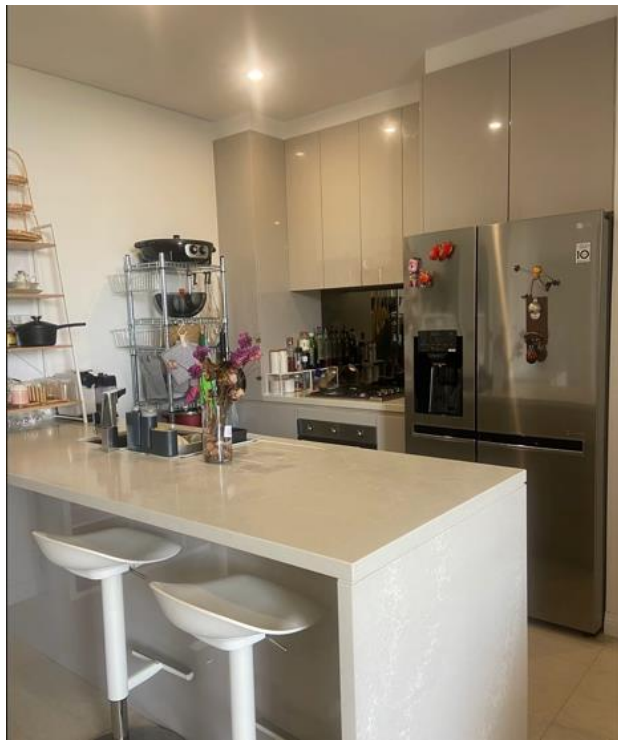
Shared fully equipped kitchen