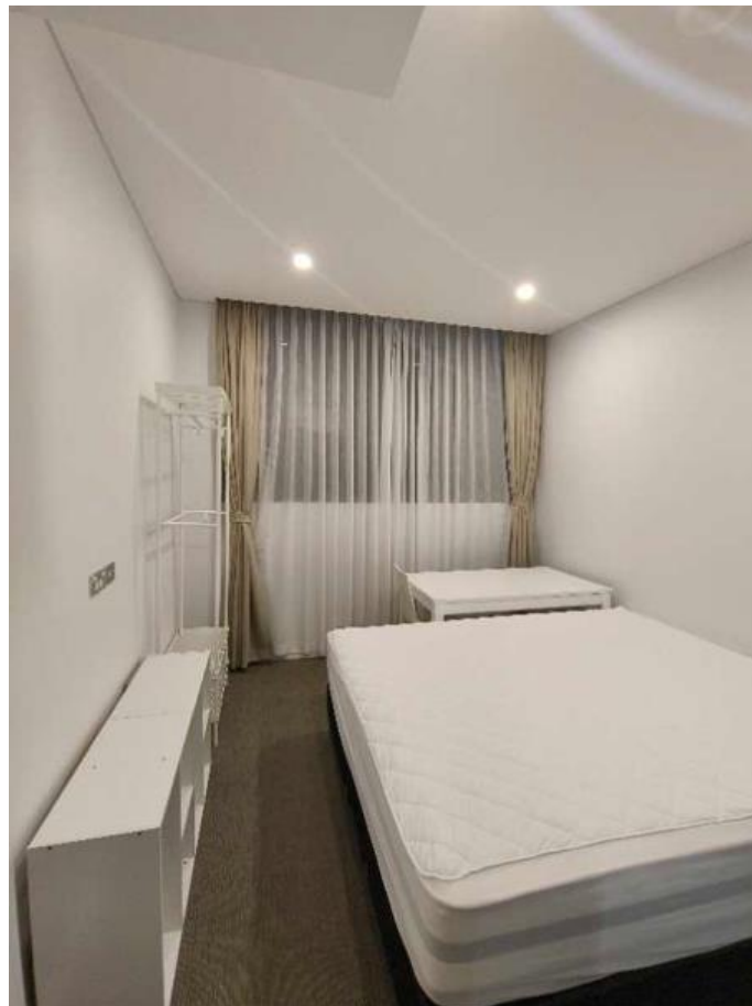
Fully furnished room for rent

Area in red is apartment, blue area are room windows