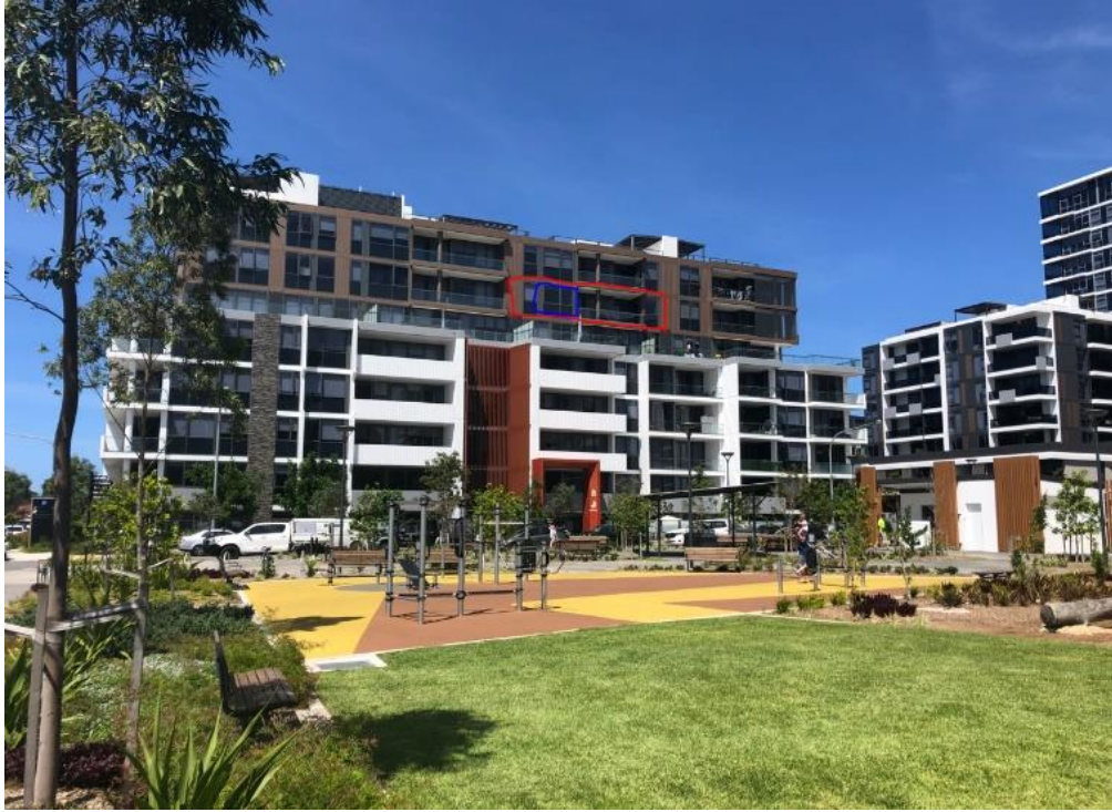
Building - 8 Studio Drive, Eastgardens

Area in red is apartment, blue area are room windows